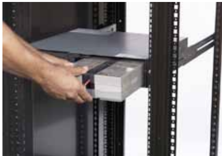
UPS models like the Eaton 9130 feature hot-swappable batteries for maximum uptime

Hot-swappable batteries allow the batteries to be changed out while the UPS is running. User-replaceable batteries are usually found in smaller UPSs and require no special tools or training to replace. Batteries can be both hot-swappable and user-replaceable.