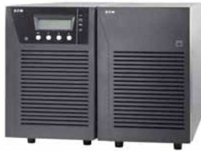
Adding extended battery modules increases runtime but does not increase the power rating or capacity of the UPS

Adding more batteries to a UPS can increase the battery runtime to support the load. However, adding more batteries to the UPS does not increase the UPS capacity. Be sure your UPS is adequately sized for your load, then add batteries to fit your runtime needs.